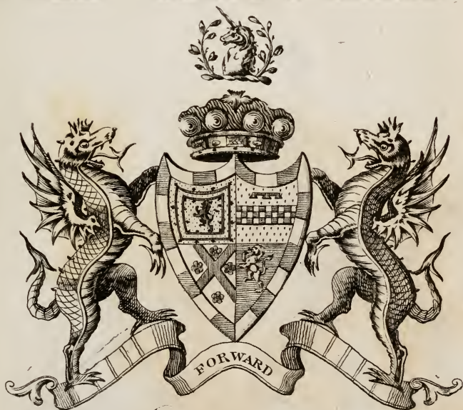
Stewart, Lord Castlestewart.